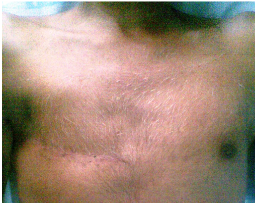
Figure 3: Healed scar after modified radical mastectomy