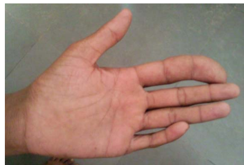
Figure 1: Macrodactyly of left Index finger

A 16-year-old man presented with enlarged left index finger and a soft tissue linear swelling in the left wrist extending to the palm. This problem started at the age of two and had progressed gradually for the past three years. He did not complain of neurologic symptoms like pain and paresthesia. Physical examination revealed a soft tissue mass in the left wrist extending to the palm with enlarged left index finger ( Figure 1 ). Overlying skin was normal. There was no local rise in temperature. Patient could move the fingers but some restriction of movement was noted at the distal interphalangeal joint of the left index finger. There were no alterations in sensation in the fingers. It was non-tender, soft in consistency and was non-compressible.