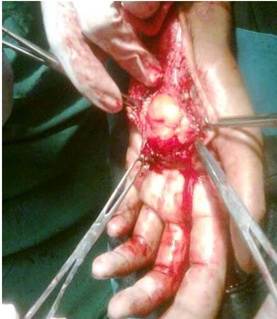
Figure 2: The mass as revealed at surgery

Under general anaesthesia, skin was incised followed by incision of flexor retinaculum. The median nerve was found to be enlarged and tortuous from the level of the carpal tunnel ( Figure 2 ). Swelling was prominently visible on both sides of flexor retinaculum. The nerve was insinuated with fibrous tissue and fat. The carpal tunnel was opened and debulking of the tumour was performed. Grossly, the tumour appeared pink-yellow in colour.