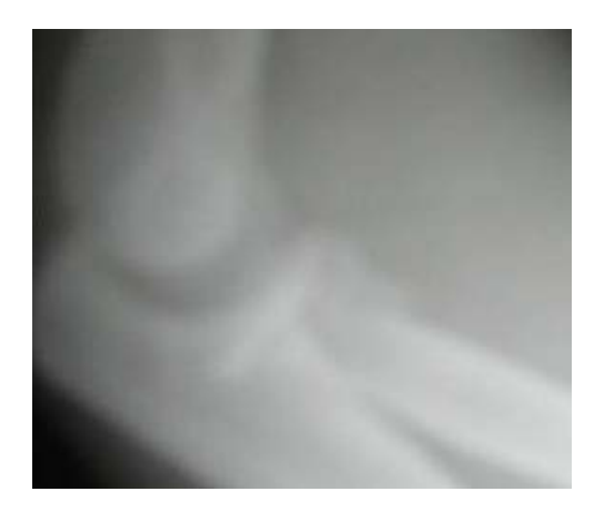
Figure 3: Showing fixation of radial head by K-wire

All elbows were screened ( Figure 3 ) on the table by an image intensifier to confirm reduction and length of K-wire.