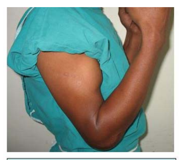
Fig-5 Showing some limitation of movement of elbow