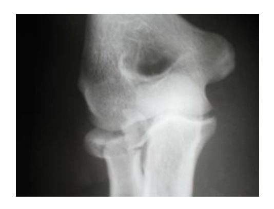
Figure 1: Showing Masion type II fracture of radial head