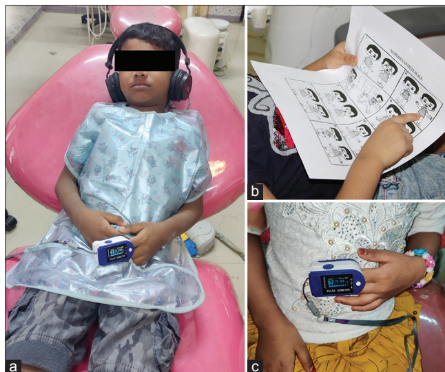
Figure 2: (a) Presentation of binaural beats to the patient before beginning the treatment procedure, (b) Subjective assessment of anxiety level by Venham's picture test, (c) Assessment of pulse rate by pulse oximeter.

done using Friedman's (for >2 observations) followed by pairwise comparison using Wilcoxon Signed rank test. For all the statistical tests, P < 0.05 was considered to be statistically significant, keeping \alpha error at 5% and \beta error at 20%, thus giving power to the study as 80%.